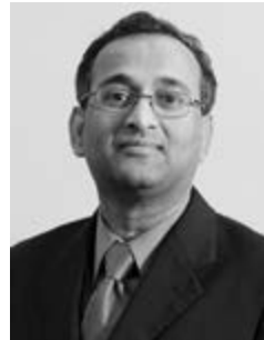
Simon Fraser University